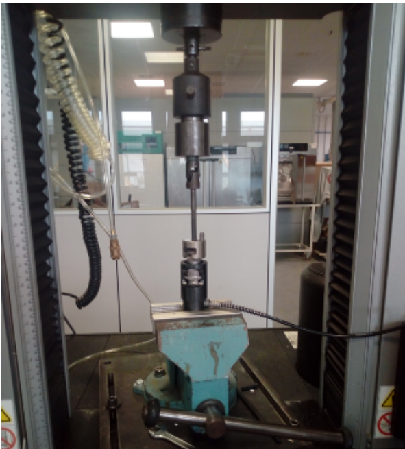
Picture #1. The instant of the experiment. Two dollies, glued together, are connected to the dynamometer and the pull-off tester at the same moment.

Moreover, if an initial set up of the pull-off tester at 0,7 MPa is possible without causing the detachment of the dolly, it means that the test is in line with the range of operativity of the instrument.